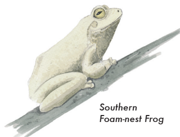
Southern Foam-nest Frog